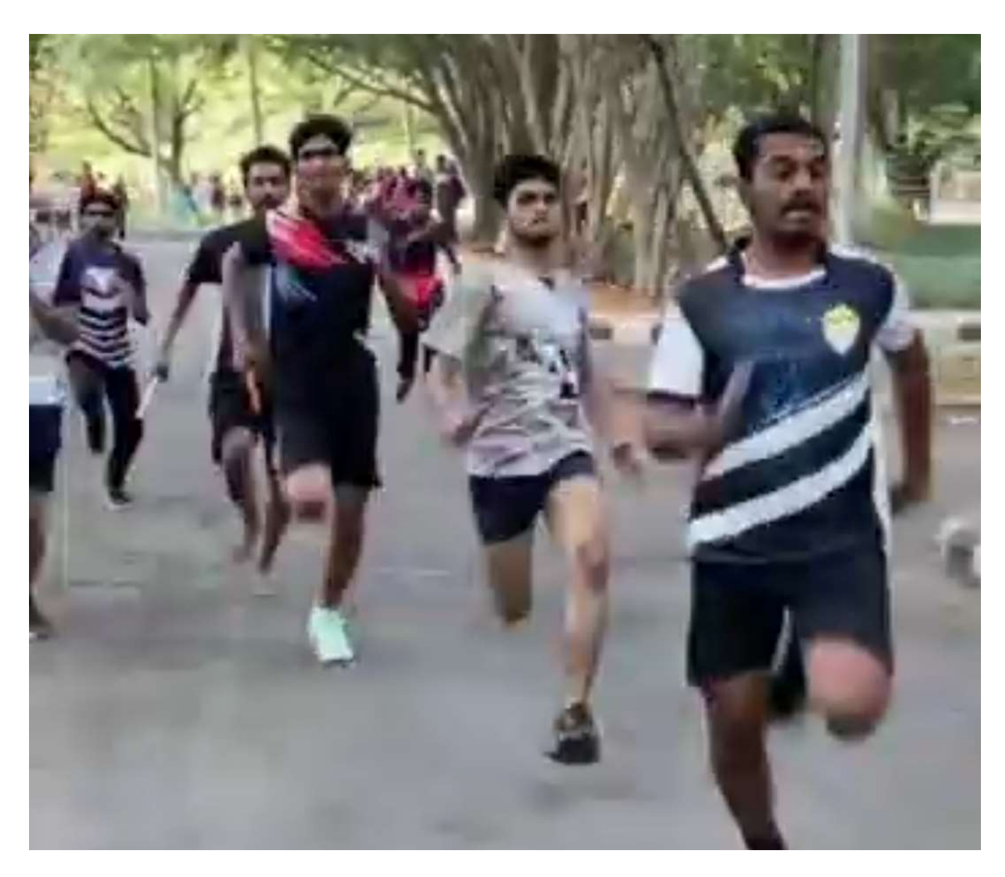
Relay Winner-Computer Department

After inauguration ceremony I declared all the schedule of other Sports.