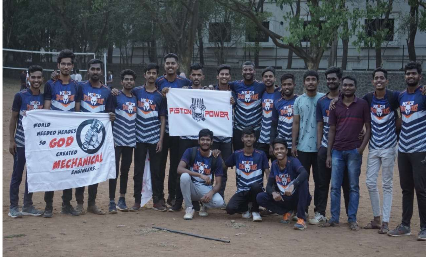
Page 13 | 21