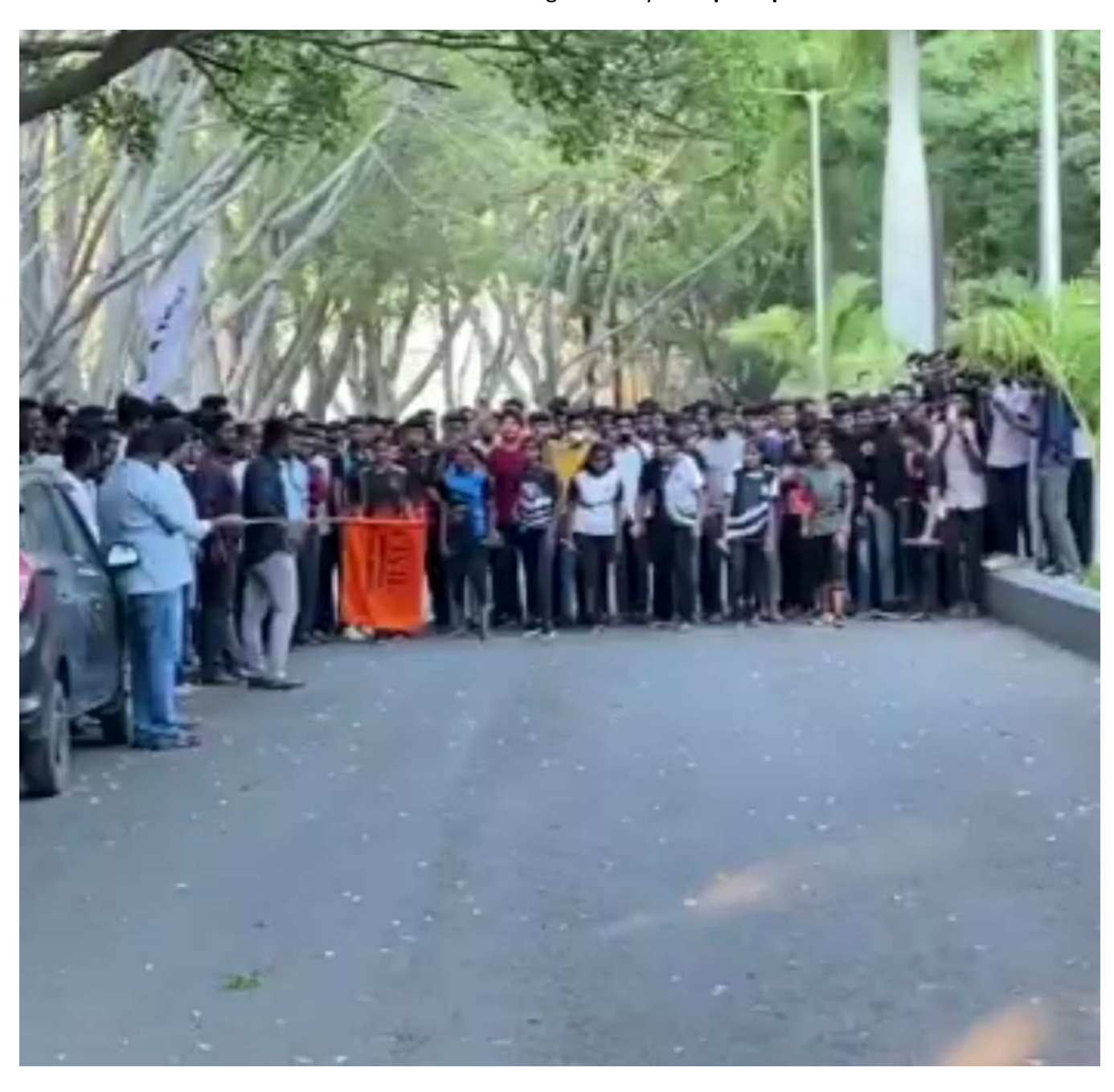
Then we started first event CAMPUS RELAY inaugurated by Vice-principal sir.