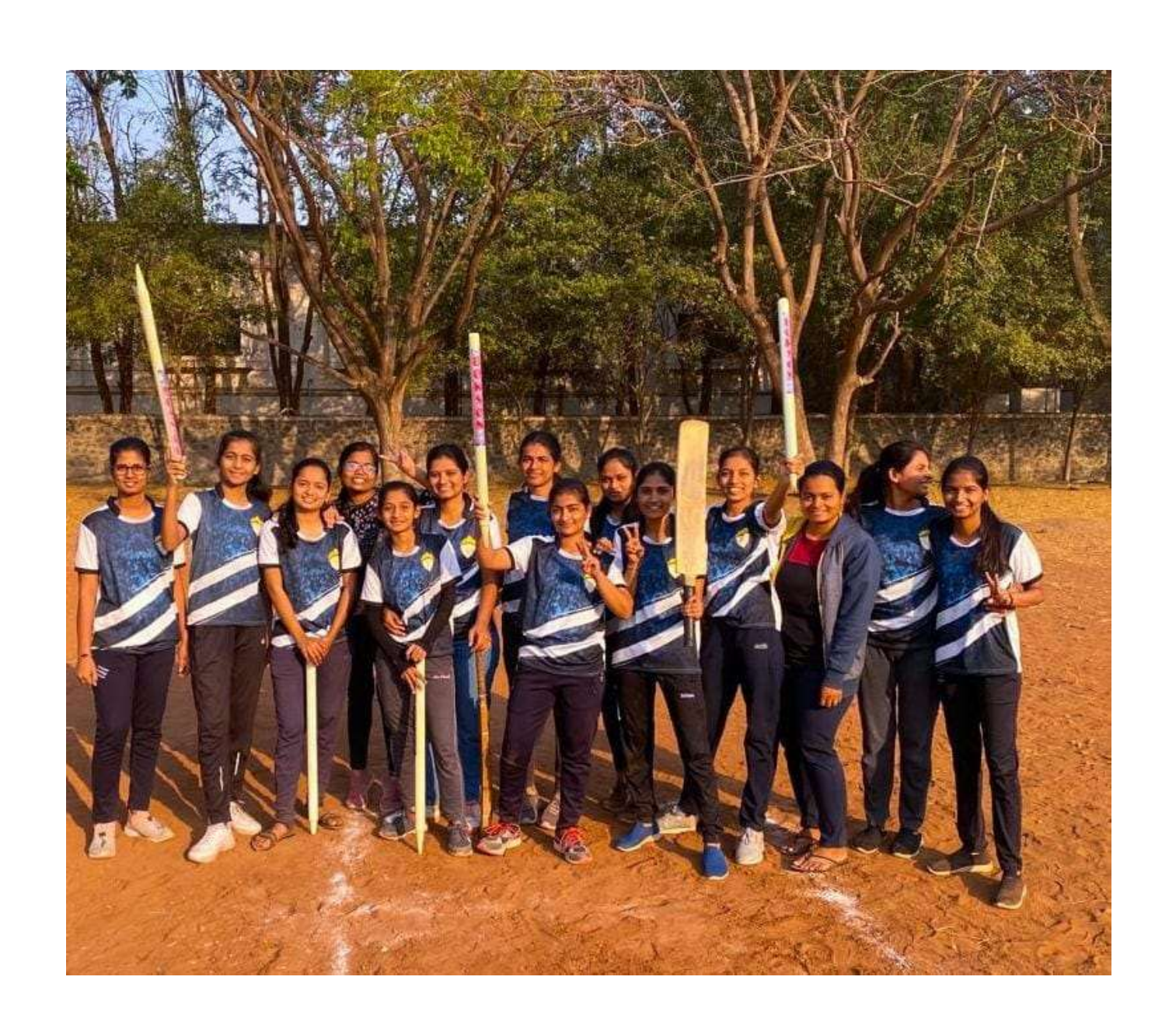
Box Cricket Winners- Civil Department