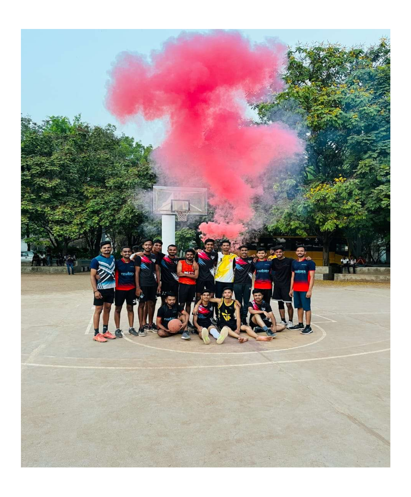
Basketball(Boys) Winner-Computer Department