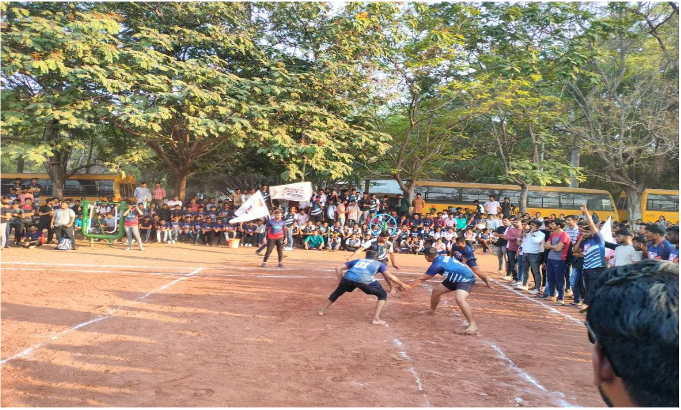
Kabaddi winners- IT Department